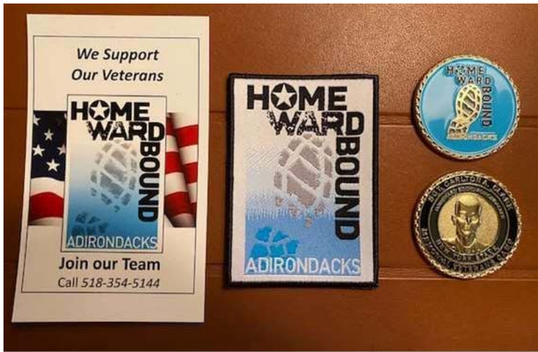
Window Decal Shoulder Patch Challenge Coin